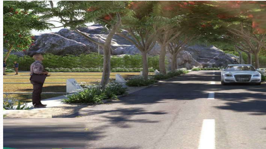
BTM LAYOUT @ BANGALORE