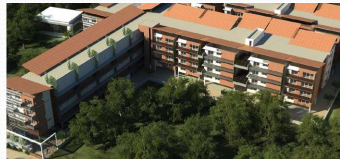
S2 Homes Apartment @ Sarjapur road,