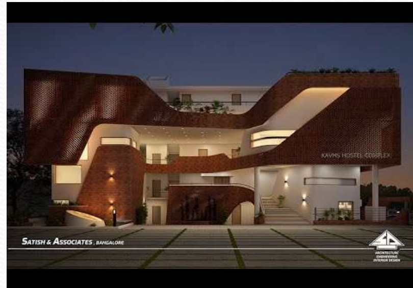
KARNATAKA ARYA VISHYA HOSTEL @ MYSORE