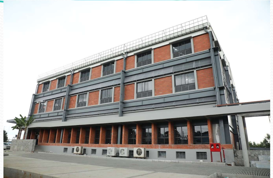
DARSHAN AGARBATHI FACTORY @ JIGANI