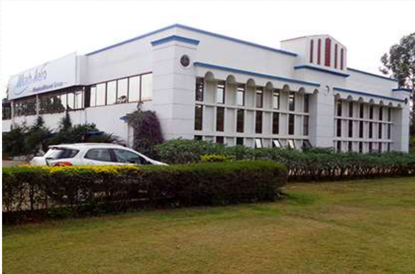
MACHEROY FACTORY @ DODABALLAPURA