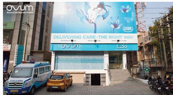
OVUM @ BANGALORE