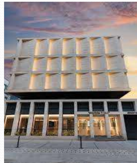
TILE ITALIA @ KORMANGLA