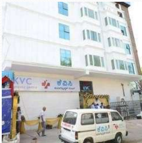
KVC HOSPITAL @ MYSORE