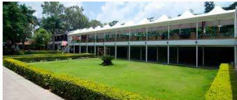
BANGALORE CITY INSTITUTE CLUB @ BANGALORE