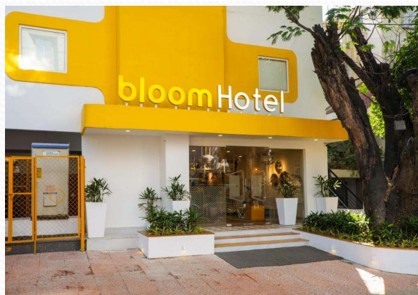
BLOOM HOTEL @ AIRPORT ROAD