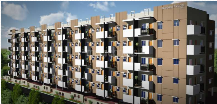
SKANDA PARADISE RR Nagar