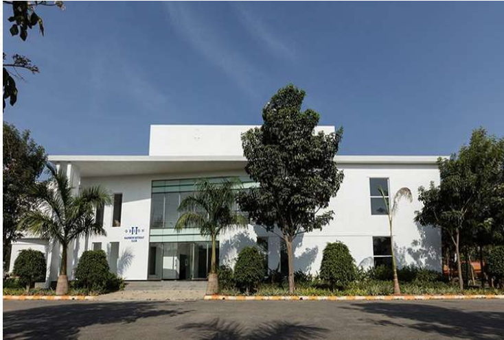
ODION CLUB HOUSE @ BANGALORE