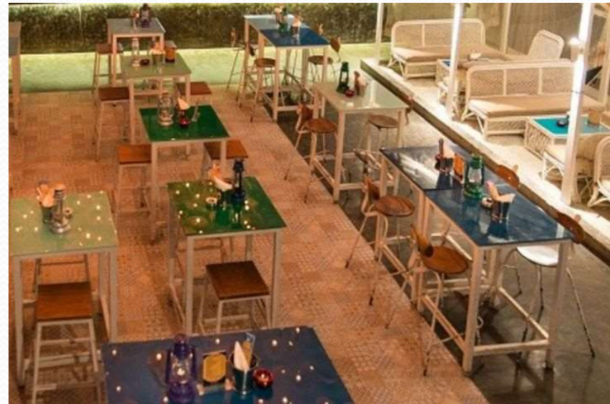
PUB @ HYDERABAD