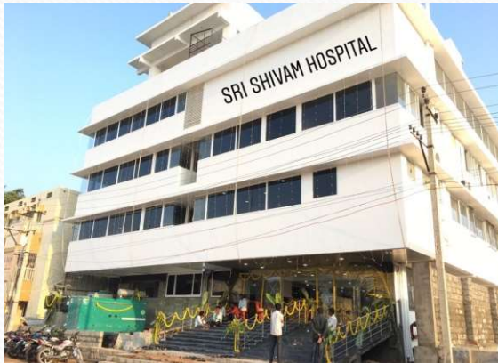
SRI SHIVAM HOSPITAL @ RAICHUR