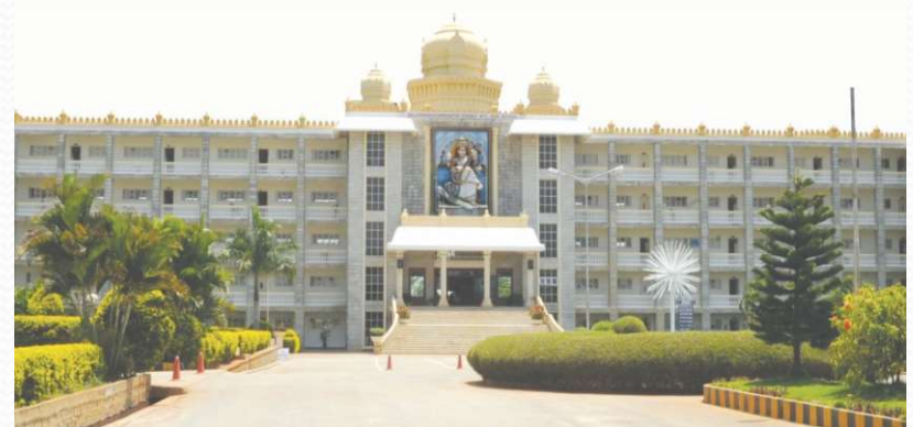
BGS SCHOOL @ Ramanagar