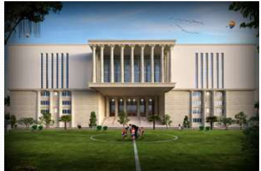
CHIRST UNIVERCITY @ YESHWANTHAPURA