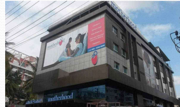
MOTHER HOOD HOSPITAL @ BANGALORE