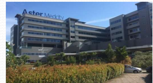
ASTERMEDICITY @ KOCHI