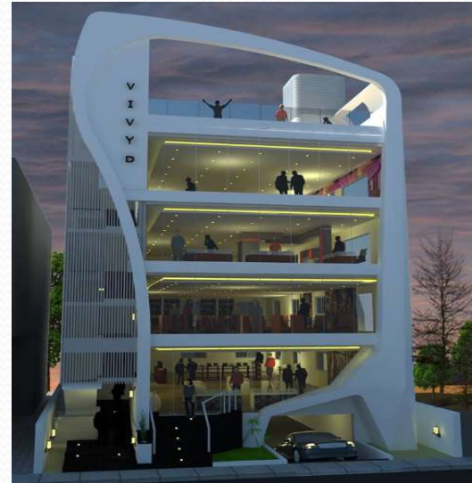
COMMERCIAL PROJECT Vidhayarnyapura, Bangalore