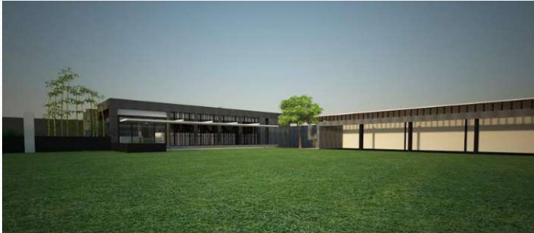
V.R.MINERALS FACTORY RR Nagar