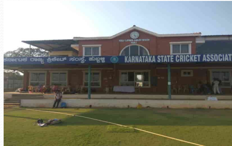
KSCA STADIUM @ BANGALORE