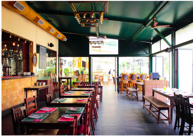
BREW MANTRA @ WHITE FIELD