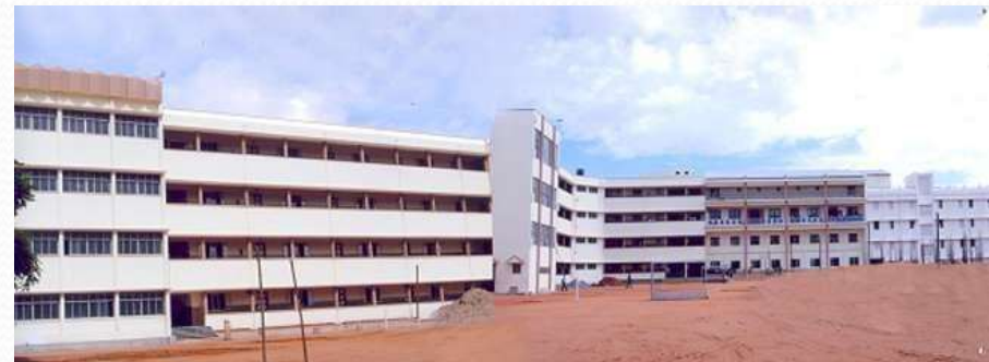
SBOI School @ Coimbatore