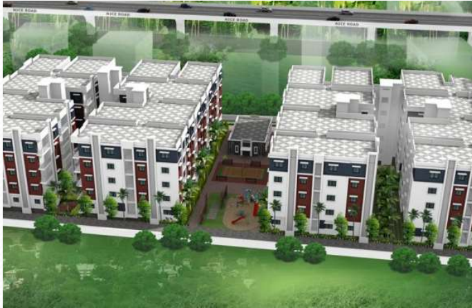
ASHIRVAD BUILDETECH Bangalore