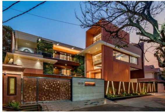
CADABAMS RESIDENCE @ BANGALORE