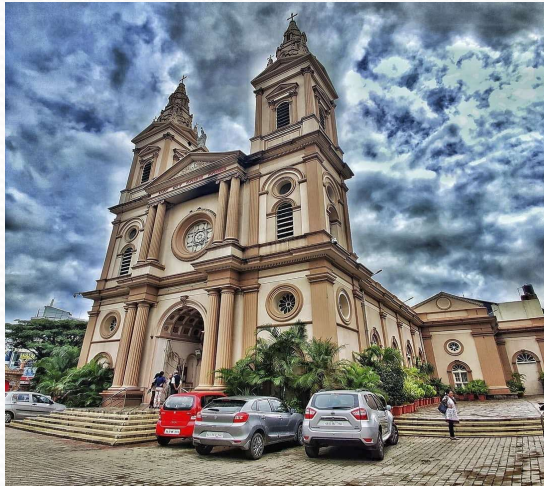
ST.PATRIC CHURCH @ BRIGADE ROAD