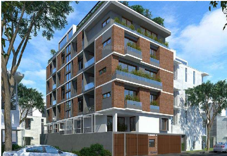
EVANTAH @ BANGALORE