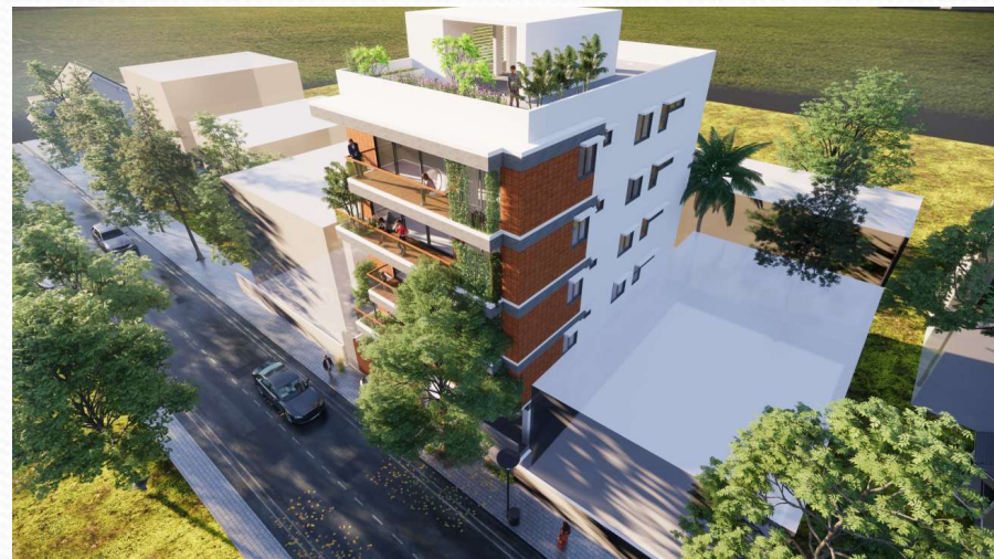
SAI VRIDDI @ BANGALORE