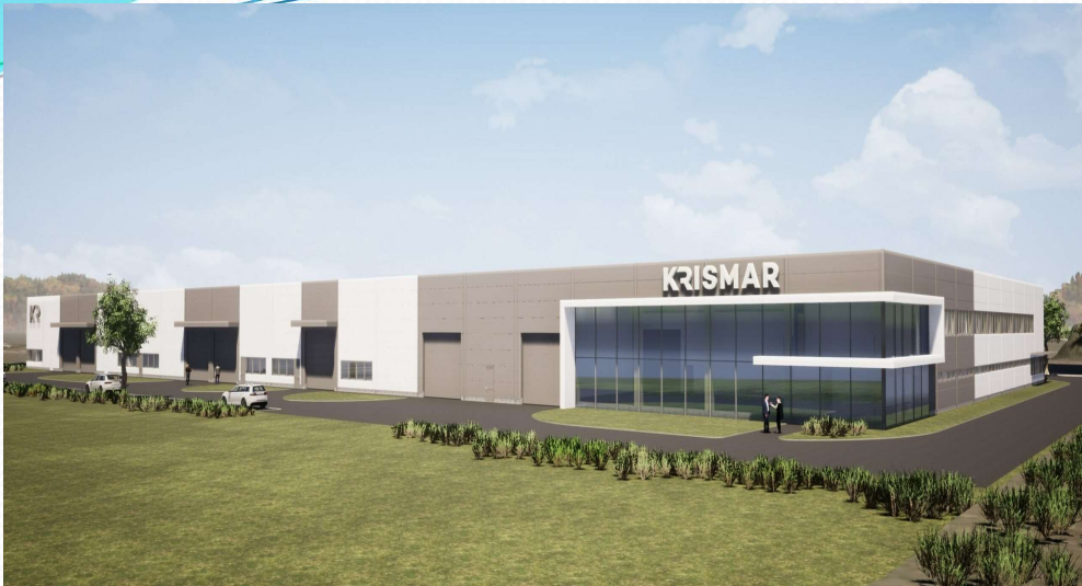
KRISMAR FACTORY @ HOSUR