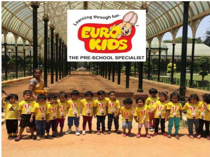
EURO KIDS @ BTM