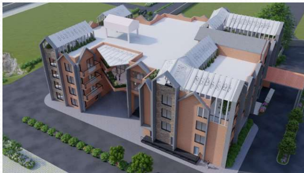
TTD Guest House @ Tirumala