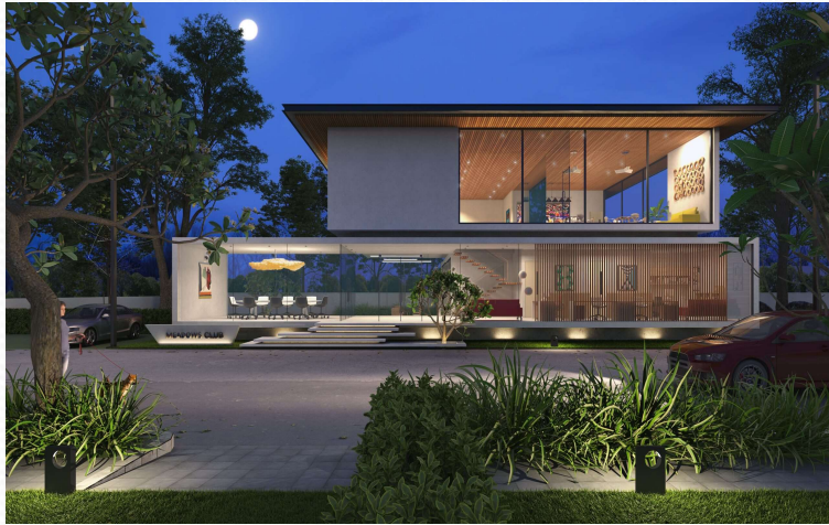
BTM CLUB HOUSE @ BANGALORE